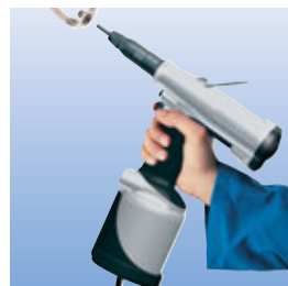
P2005 for setting RIVKLE® blind rivet nuts and studs M3 to M12 (displacement-controlled)