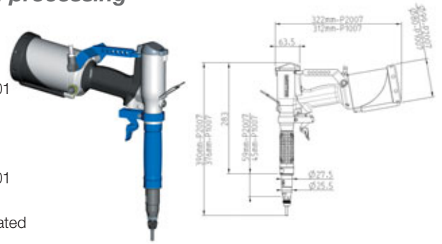
Weight vertical tool: 0.64 kg