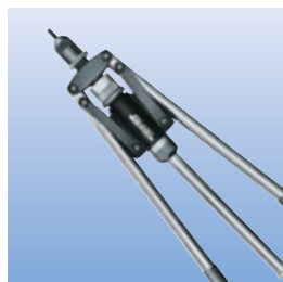
Manual installation tools

An optimal installation process is the result of an optimal combination of quality, speed and costs. This is why Böllhoff offers a broad range of assembly solutions for the most diverse requirements. Feel free to contact us for the perfect choice of device for your requirements.