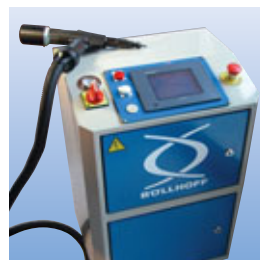
EPK C with integrated process control and counter